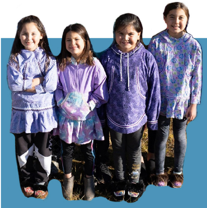
Galena City School District students.

In zooming out, and a target that spreads across all focus areas of our GCSD Strategic Plan, we recognized providing Early Childhood programs as another way to increase achievement for students and allow our partnerships with families to begin even earlier. We began grant writing and reaching out to our local tribal partners for support. No one hesitated, as supporting families and education supports not only our community but provides a boom to communities in our entire region for many years to come. The grants secured include plans to write culturally aligned units of study for our early learning programs, further