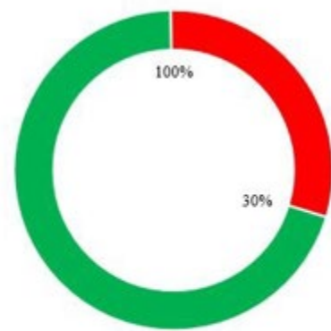
Figure 4. Acceptable range of student-centered expenditures (30-100%).